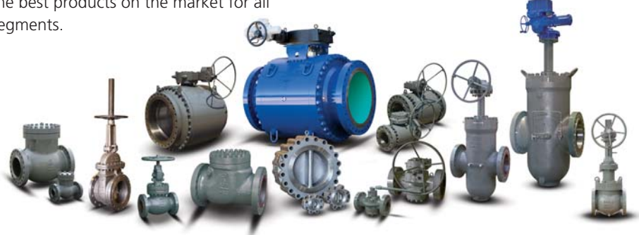
The SCV valve family: Piston Checks, Full Port Swing Checks, 3-Piece Trunnion Mounted Balls, Wedge Gates, Globes, Lubricated Plugs, Dual Plate Checks, Thru Conduit Gates, & Rising Stem Balls.