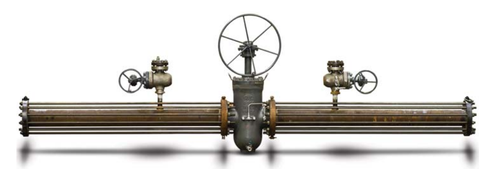
Size: 8", Class: 900 SCV API 6D Thru Conduit Valve (Expanding Gate Design) modified with by-pass ventilation assembly, pipe pups, and twin bypass 2" – 1500 Thru Conduit Gates (Expanding Gate Designs) (flanged for testing).