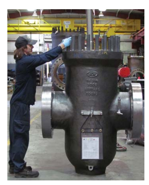
Assembly of 16-3/4" – 5000 PSI SCV API 6A Thru Conduit Gate Valve (Expanding Gate Design).

Absolutely! One design specifically SCV Valve manufactures is the large-bore API 6A Thru Conduit Gate Valve in sizes 9", 11", 13-5/8" in pressure classes 2000, 3000, & 5000. This product is unique because so few manufacturers offer this configuration, therefore, competition is very limited.