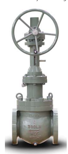
Size: 6" – Class: 300 SCV API 6D Rising Stem Ball Valve.

The patent pending SCV Valve API 6D 150# expanding gate valve has offered us avenues into markets and end user facilities given the unique design capacities and operational excellence of the valves. SCV Valve's patent pending Rising Stem Ball Valve will allow us to capture our part of the specialty valve market. Several unique features have been engineered into this product that allow for smooth operation and inline-serviceability, including a retaining system for fast and easy seat changes.