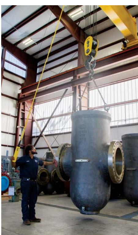
Moving 30" 600 Thru Conduit casting into position for assembly.