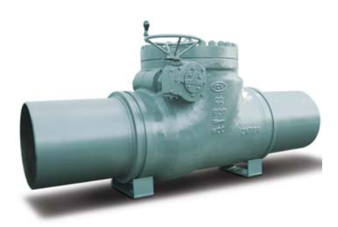
Size: 22", Class: 600 SCV API 6D Full Port Swing Check modified with lock open device.