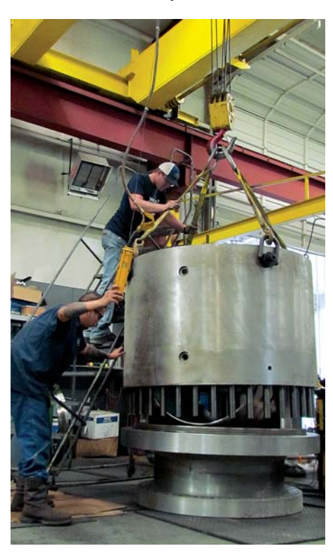
Assembling 36" 600 SCV Trunnion Mounted Ball Valve.

Phase III, will consist of a 20,000 square foot finished-inventory warehouse.